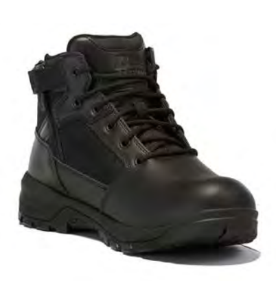
SPEAR POINT BV915Z HOT WEATHER LIGHTWEIGHT SIDE-ZIP TACTICAL BOOT PAGE 24