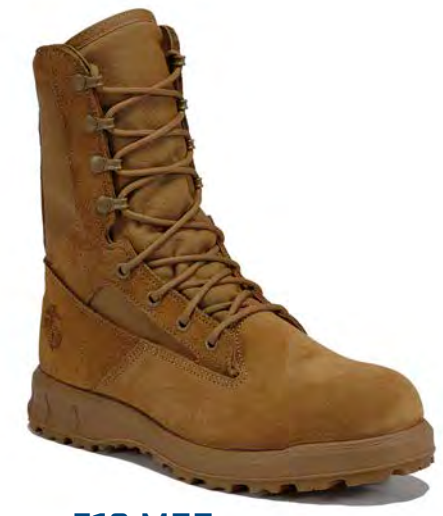
510 MEF ULTRALIGHT MARINE CORPS COMBAT BOOT PAGE 16