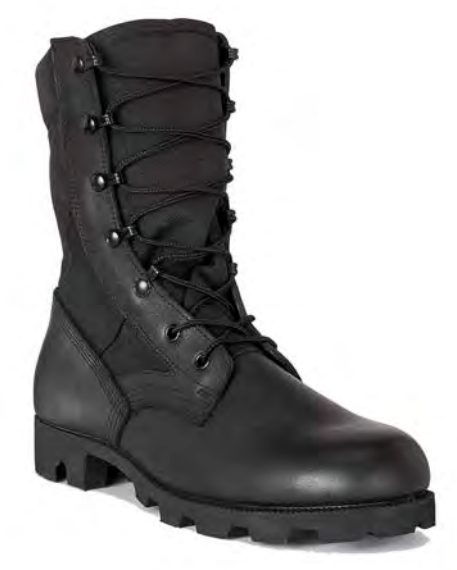
CANOPY BV903PR JUNGLE BOOT PAGE 24