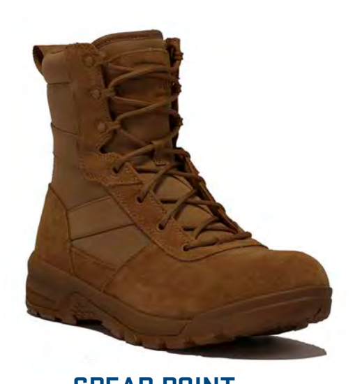
SPEAR POINT BV518 LIGHTWEIGHT HOT WEATHER TACTICAL BOOT PAGE 8