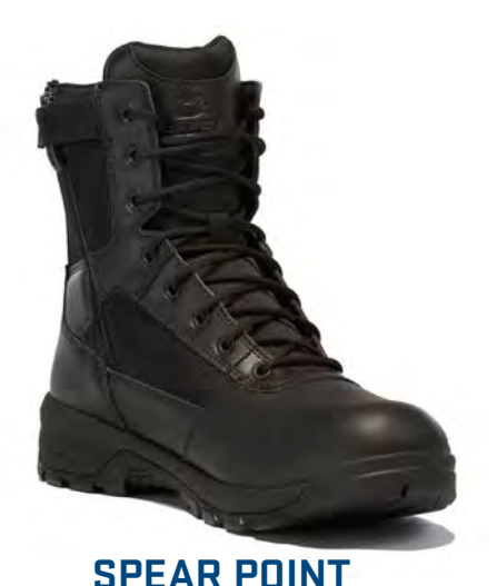
SPEAR POINT BV918Z WP LIGHTWEIGHT SIDE-ZIP WATERPROOF TACTICAL BOOT PAGE 25