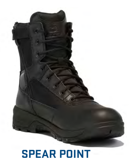
BV918Z HOT WEATHER LIGHTWEIGHT SIDE-ZIP TACTICAL BOOT PAGE 25