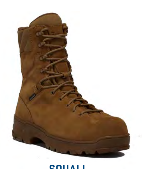
SQUALL BV555INSCT 400g INSULATED COMPOSITE TOE BOOT PAGE 15