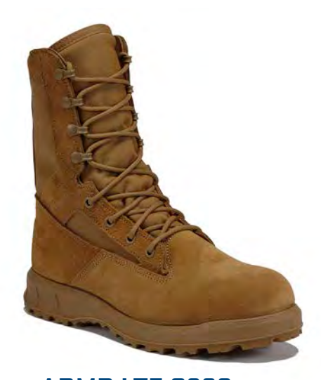
ARMR LTE C290 ULTRALIGHT COMBAT & TRAINING BOOT PAGE 5