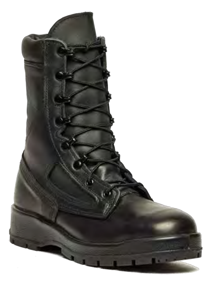
495 ST / F495 ST US NAVY "I-5" STEEL TOE BOOT PAGE 20