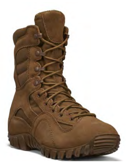
KHYBER TR550WPINS WATERPROOF INSULATED MULTI-TERRAIN BOOT PAGE 15