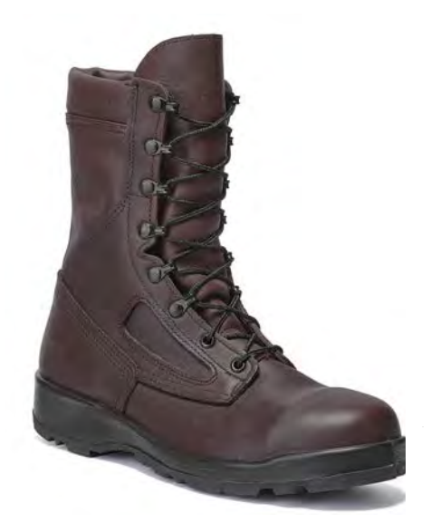
339 ST US NAVY AVIATOR BOOT PAGE 20