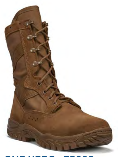
ONE XERO™ FC320 FEMALE ULTRALIGHT ASSAULT BOOT PAGE 4